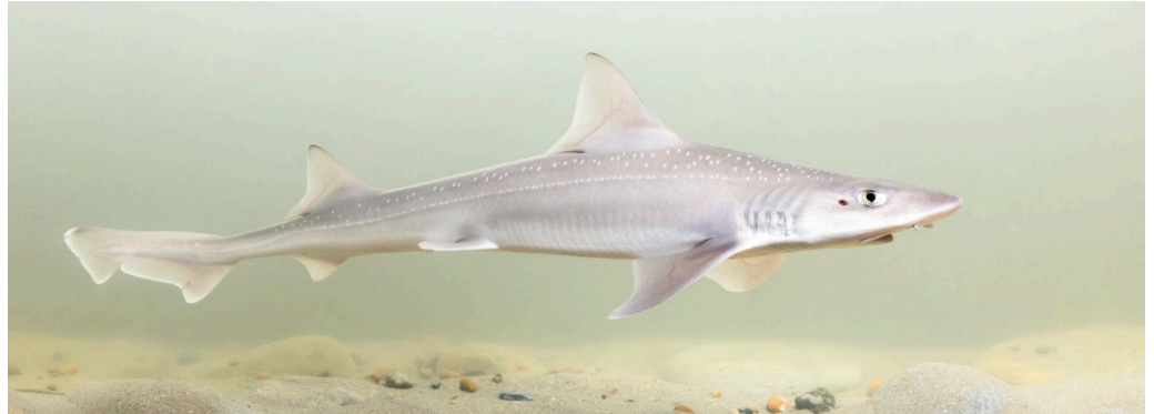
Image: Bram Conings ©. To reproduce this image, permission must be granted by the copyright holder.